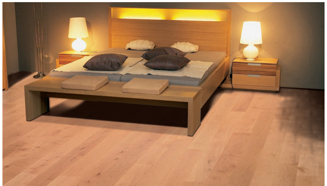
Symbol picture - may vary in colour and structure